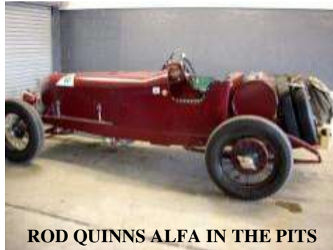
ROD QUINNS ALFA IN THE PITS

around the corner with one hand and holding the thing in top certainly gets you into turn two pretty quickly. When you learn to not back