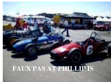
FAUX PAS AT PHILLIP IS

I looked up the pairs results from 2001 when they started the little pissing competition at Phillip Is and they were doing 2:18 laps, at the rate of improvement of about 1 second per year (2001-2010) then by 2023 you will have eclipsed Pommy Rod Jolly's time of 1:52 in the Cooper Climax.