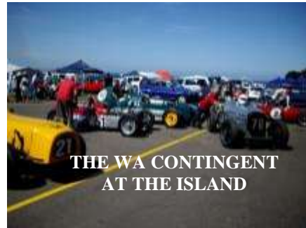
THE WA CONTINGENT AT THE ISLAND

Phillip Is. this year showed just how quick some of the international cars are, those of us who had ventured across the ditch to New Zealand had already tasted defeat at the hands of the F1 Cooper Climaxes but it was the rest of the JK and L group that got to witness it at the Island. Put it simply they won every event they finished, the only chance any others got to pass them was when they were in the pits or sidelined by mechanical failure and to witness them being driven hard is a treat to behold.