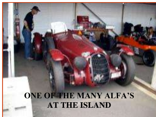
ONE OF THE MANY ALFA'S AT THE ISLAND