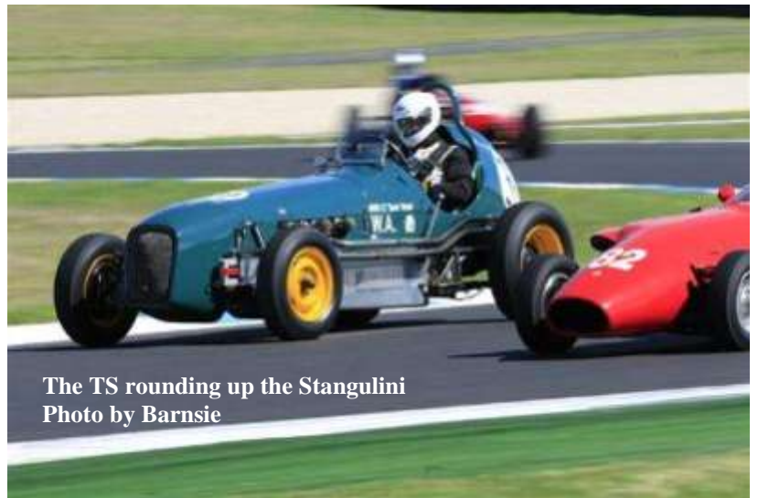
The TS rounding up the Stangulini