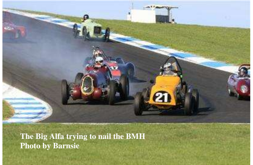
The Big Alfa trying to nail the BMH