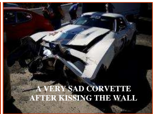
A VERY SAD CORVETTE AFTER KISSING THE WALL