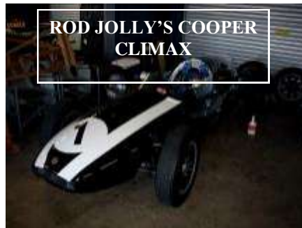
ROD JOLLY'S COOPER CLIMAX

I looked up the pairs results from 2001 when they started the little pissing competition at Phillip Is and they were doing 2:18 laps, at the rate of improvement of about 1 second per year (2001-2010) then by 2023 you will have eclipsed Pommy Rod Jolly's time of 1:52 in the Cooper Climax.